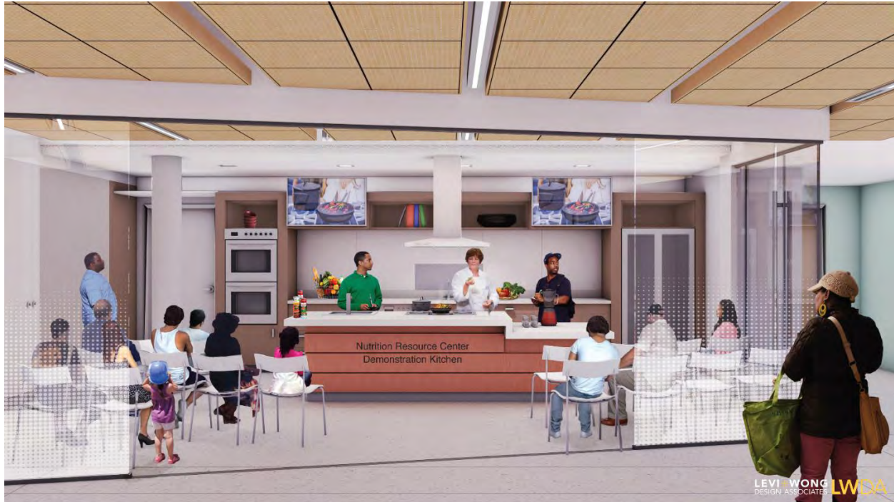
Image: Demonstration Kitchen model image