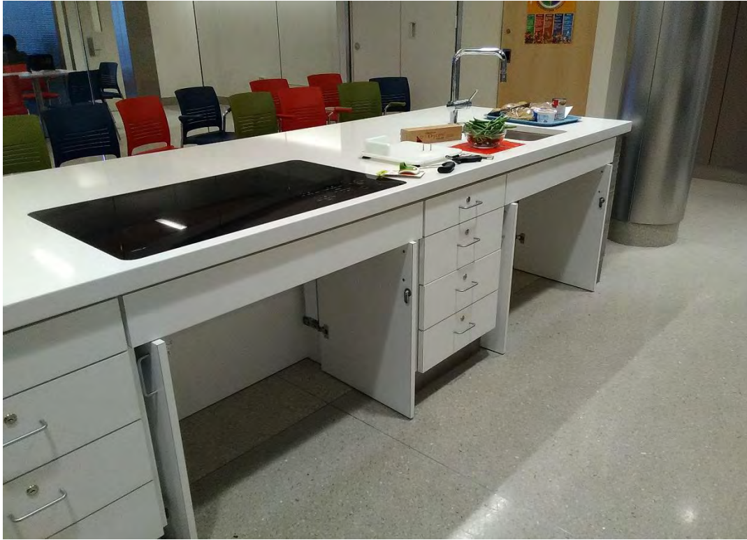
Image: Stove and sink wheelchair accessibility features

The “Healthy Cooking for People with Disabilities” class continues to meet on the last Wednesday of each month. The Demonstration Kitchen is also planning on starting a class for people with intellectual disabilities in the near future.