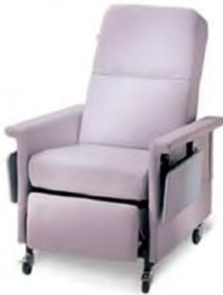
Image: After discussion and extensive research, purchaser identified an accessible option (approved)

Image: Emergency Department Recliner requested through the Strata purchasing system (not approved)