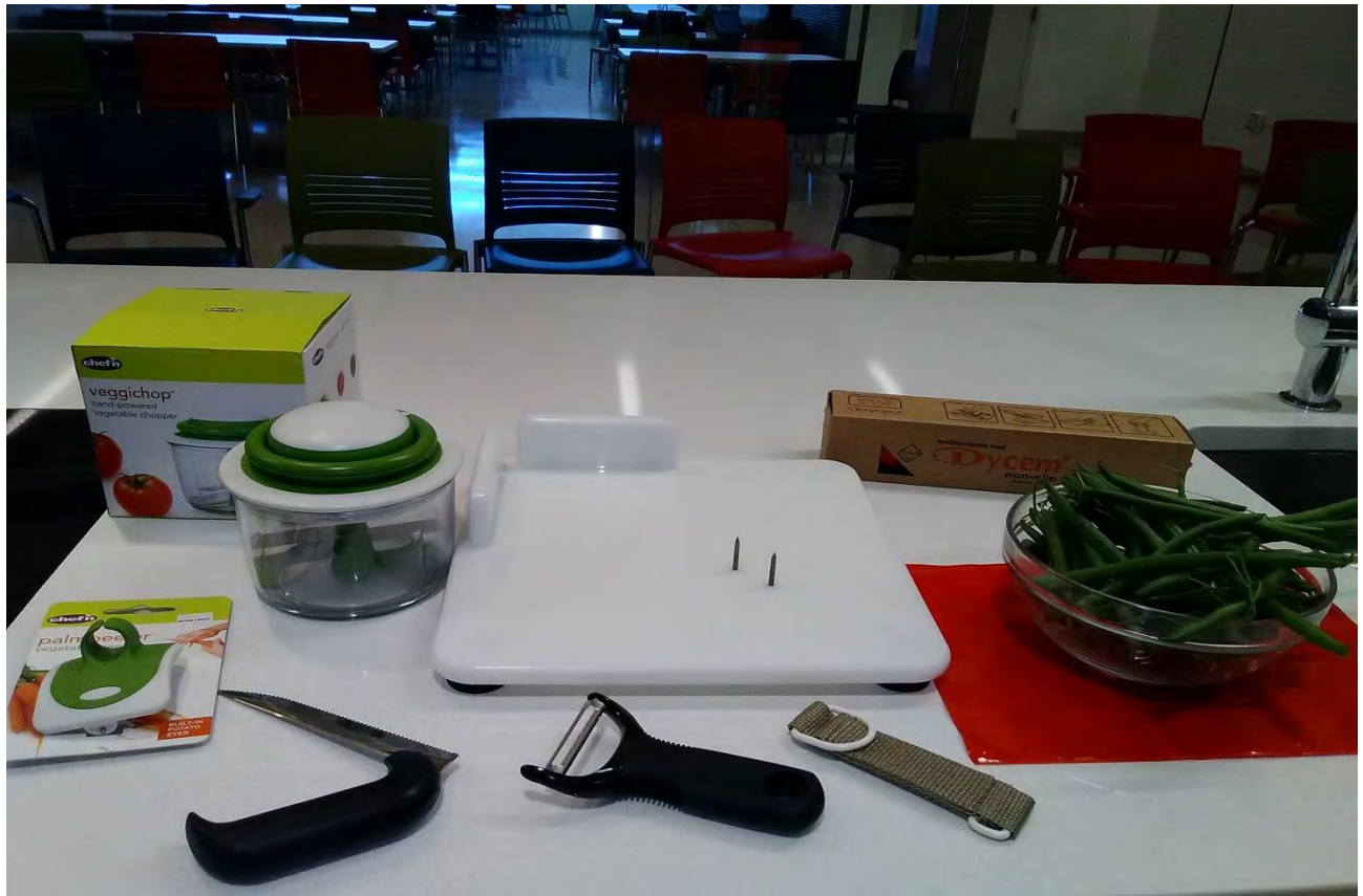
Image: Adaptive kitchen tools available at the Demonstration Kitchen

The new kitchen has enhanced accessibility features. The sink and stove are wheelchair accessible. One of CCC's occupational therapists was consulted for suggestions on adaptive equipment. This resulted in the purchase of adaptive kitchen tools to help with the cooking process such as specialty knives, wide grip vegetable peelers, hand-held food choppers, palm veggie peelers, utensil holders, and non-slip dycem mats to keep bowls from sliding when mixing.