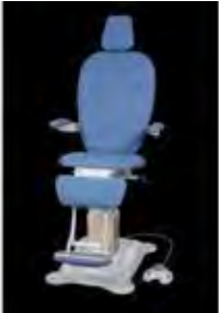
Image: Purchaser located acceptable option using Sutter Health equipment list provided by Greater Boston Legal Services (approved)

Image: Urgent Care triage chair requested through the Strata purchasing system (not approved)