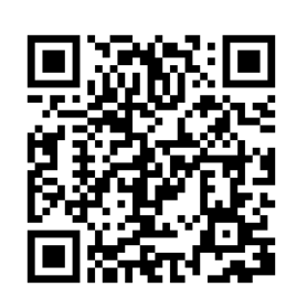
Find your Autism Support Center