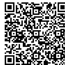
Order the Book

Chapter topics include: diagnosis, working with your medical team, therapies, insurance, government benefits, IEPs, financial planning, future care plans & more!