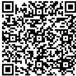
Local Cooking Classes

For example, this website called "Local Cooking Classes" will provide you with a list of options based on your town!