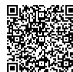
TILL Vocational Training