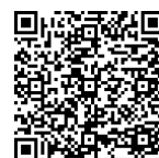
MRC Next Gen Careers